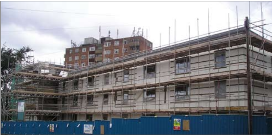
Left: Site in progress

"The homes are built to a high quality standard, utilising off-site manufacture in line with our policy to develop modern, innovative properties. They are designed to high energy efficiency standards which will help transform standards of living for our customers who will become part of a new, sustainable community in Swarcliffe."