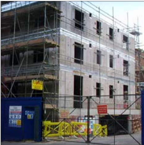
Left: Site in progress Below: Panel layout

The site at Dover Road, was very tight, made more challenging by the fact that the owners of the adjacent land would not allow jib swing over their airspace. However Structherm were able to overcome this by using combinations of all terrain mobile cranes.