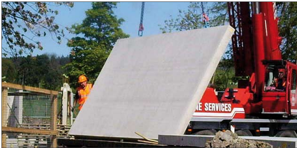
Left: Fair faced panel