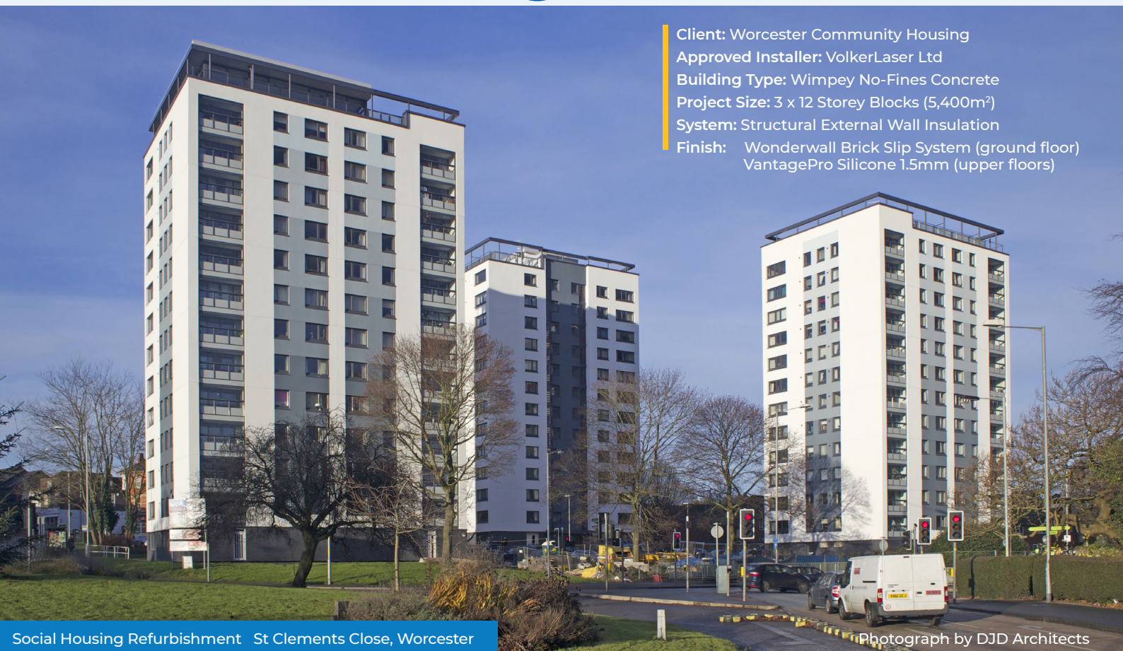
Social Housing Refurbishment St Clements Close, Worcester

Client: Worcester Community Housing Approved Installer: VolkerLaser Ltd Building Type: Wimpey No-Fines Concrete Project Size: 3 x 12 Storey Blocks (5,400m 2 ) System: Structural External Wall Insulation Finish: Wonderwall Brick Slip System (ground floor) VantagePro Silicone 1.5mm (upper floors)